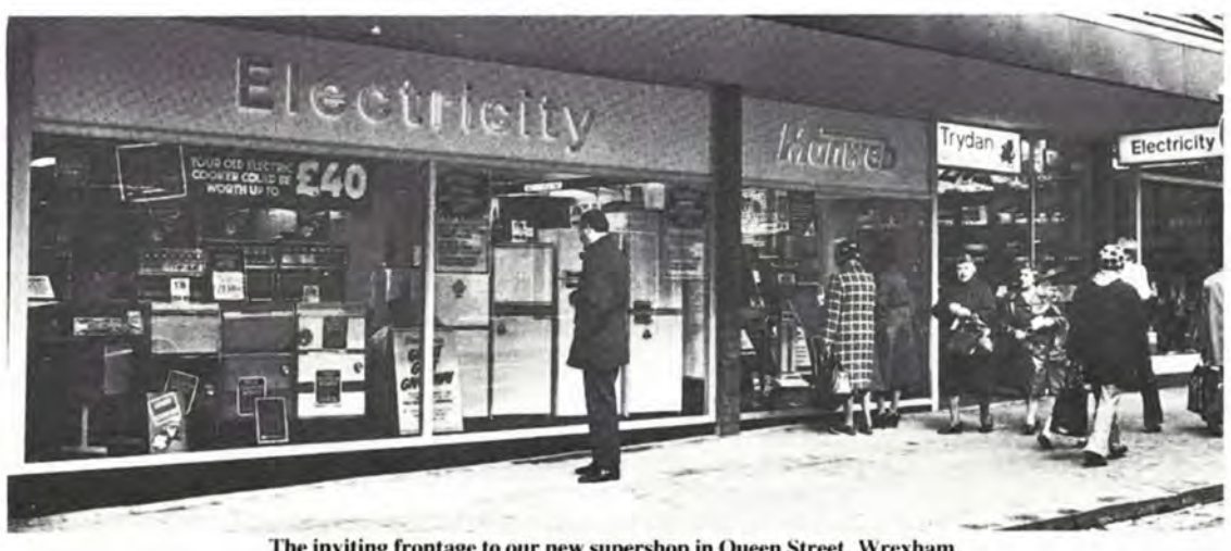
The inviting frontage to our new supershop in Queen Street, Wrexham.