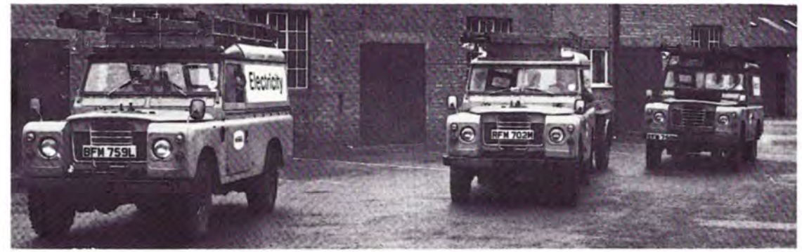
Ready to roll-a Dee Valley team leave Legacy depot.

were quickly restored. Other parts of the country were harder hit, and our colleagues in the North-Eastern, Midlands, East Midlands, South Wales and South Western Boards faced much longer struggles to restore things to normal.