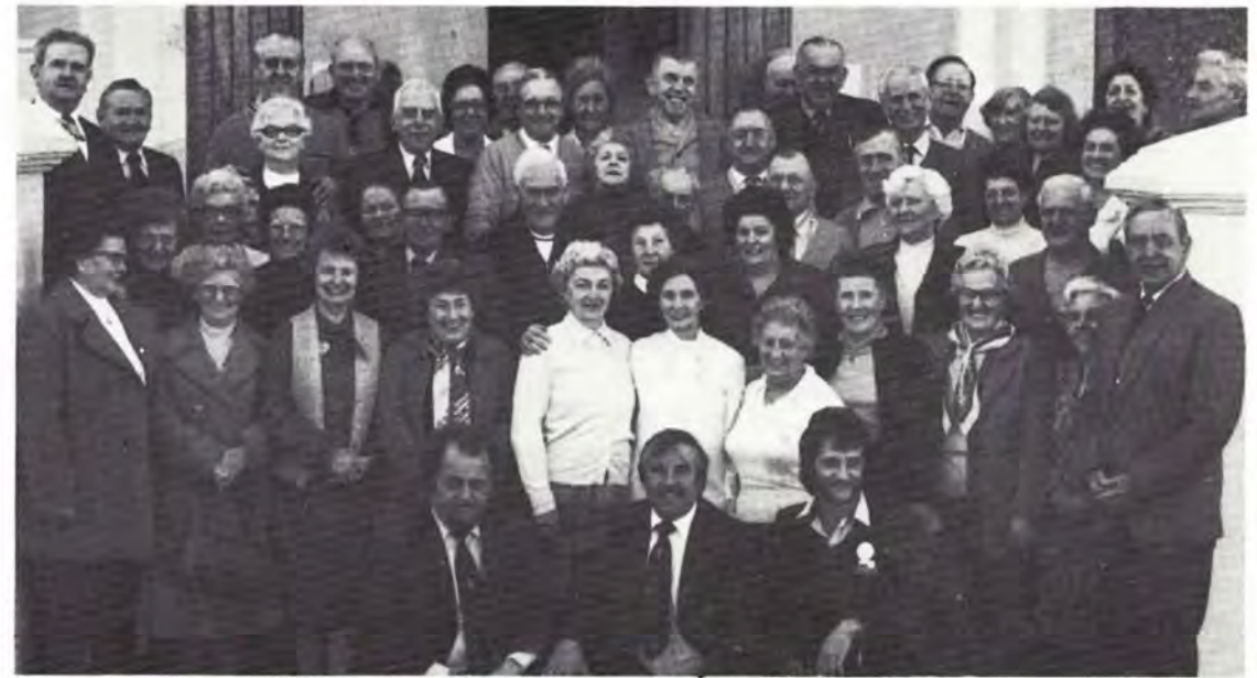
Mid-Mersey mini-holidaying pensioners in Newquay, Cornwall, recently.