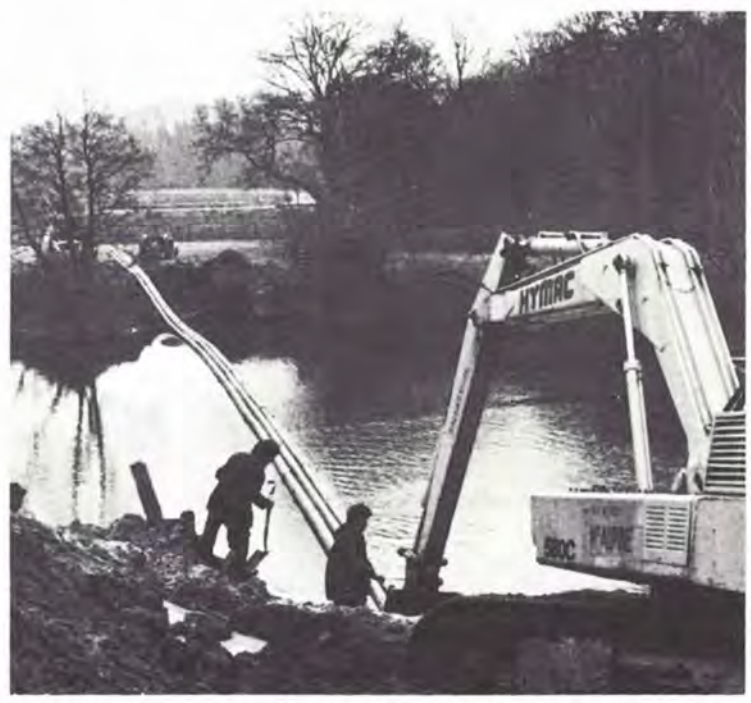
The PVC pipes, positioned across the water in readiness for sinking into the prepared trench in the river bed.

A CALL by the North West Water Authority for an increase in their electricity supply at Heronbridge Pumping Station, on the River Dee about three miles up-river from Chester, produced an interesting piece of work for our engineers.